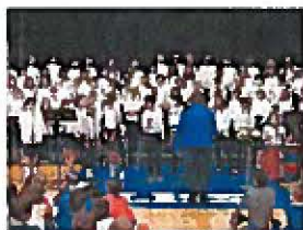
5 th /6 th Grade Concert