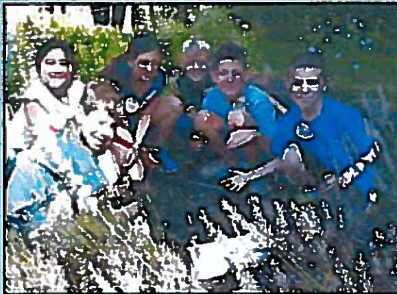
Tending to the kitchen herb garden on the historic Kissam property.

Time Travel takes on a whole new meaning! A unique summer camp designed to bring history to life!