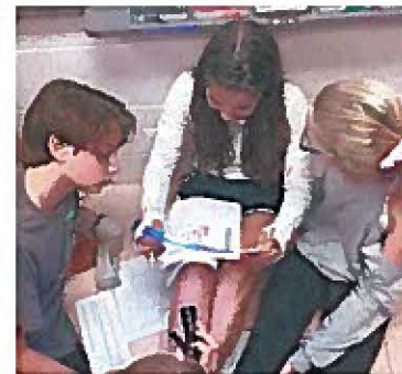
Sixth Graders "Break Out" using their deductive reasoning and math skills in the Snyder Heist!